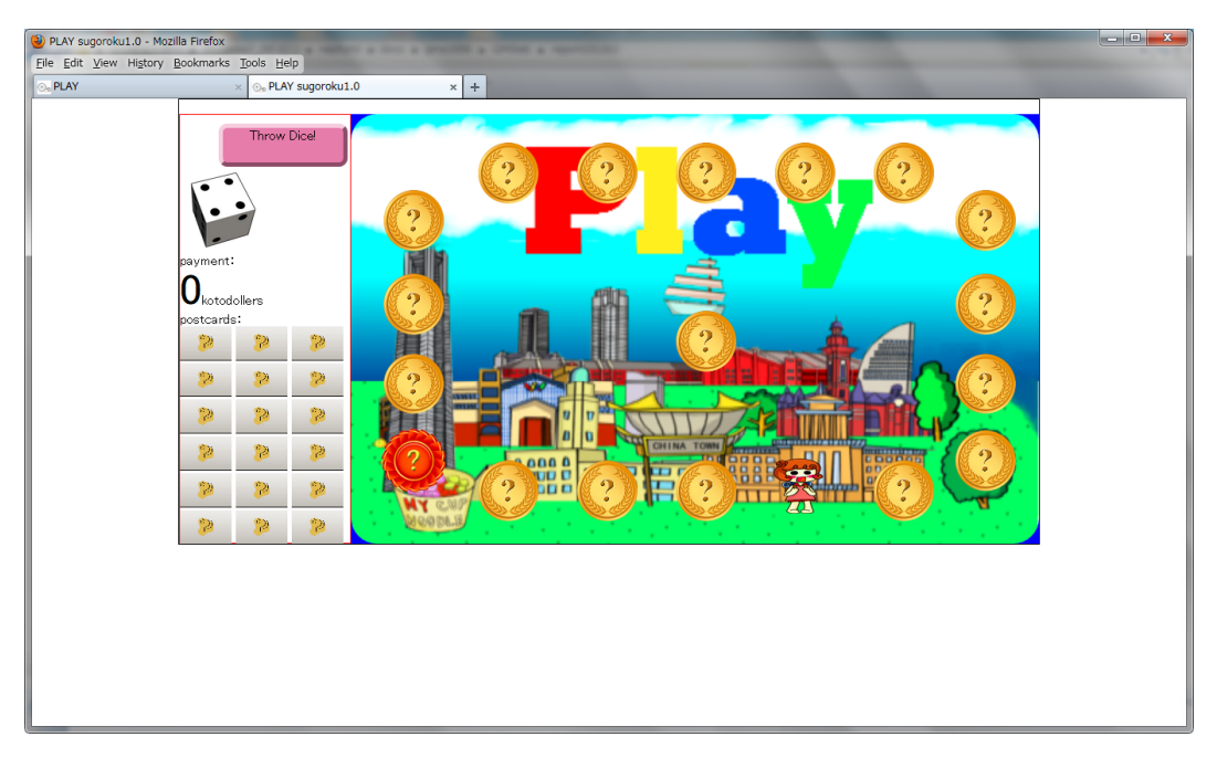
Figure 3. 寿地区周辺の観光情報サイト すごろく「PLAY」