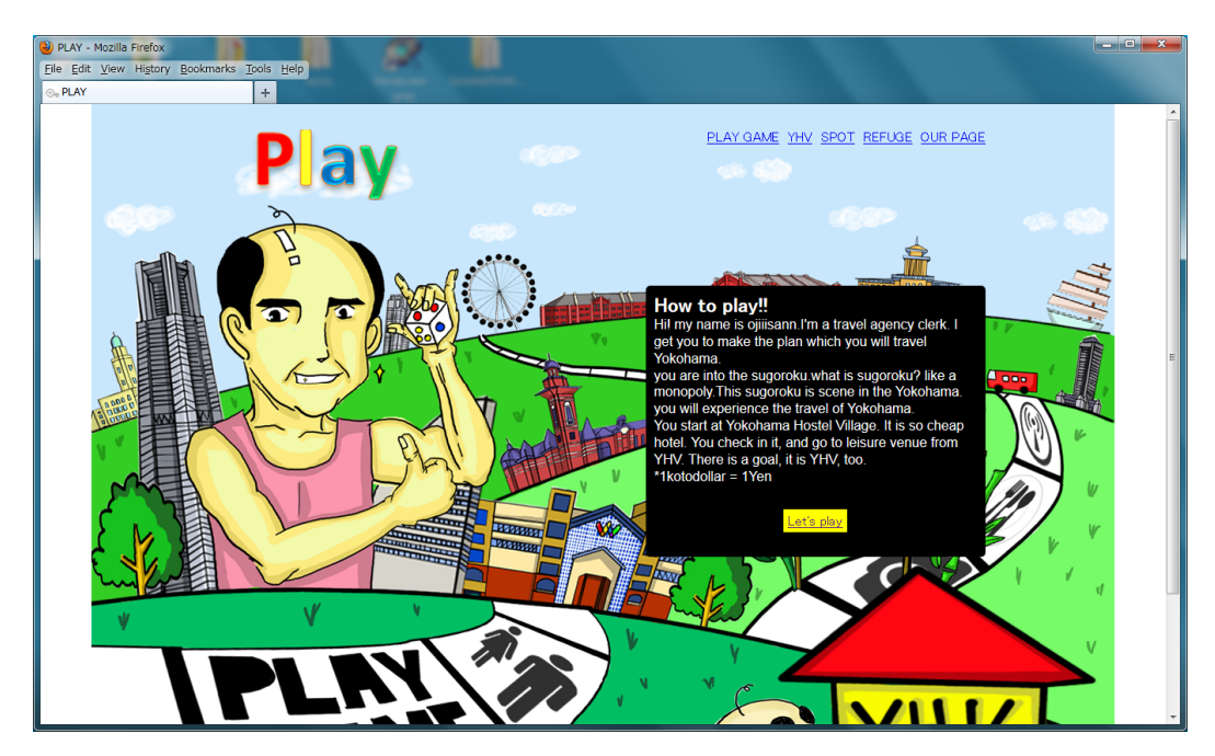
Figure 2. 寿地区周辺の観光情報サイト トップページ